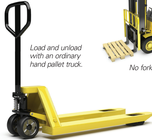
Load and unload with an ordinary hand pallet truck.

Then there's the waiting factor. Chances are you have many more hand pallet trucks than fork lifts. Rather than waiting around for a fork lift and trained operator to load or unload a device, your employee can just grab a hand pallet truck and do it on their own.