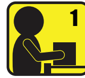
Reach Factor 1 Minimal Reach-Over