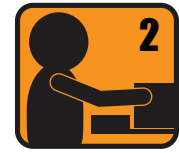
Reach Factor 2 Some Reach-Over