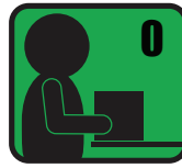
Reach Factor 0 No Reach-Over

The products in this brochure provide workers with improved access to palletized goods. Check the Reach Factor Icon associated with each product to determine the level of access it provides.