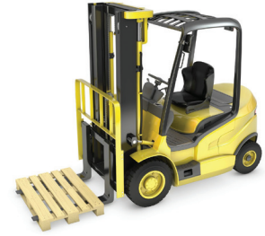
No fork lift required.